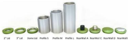
Order Numbers (please specify the camera type for each order!):