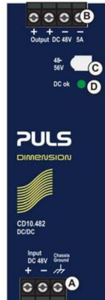
Fig. 10-1 Front side